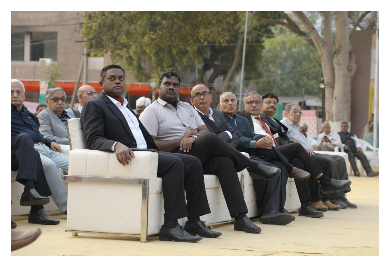
Dignitaries watching video tribute of departed souls.