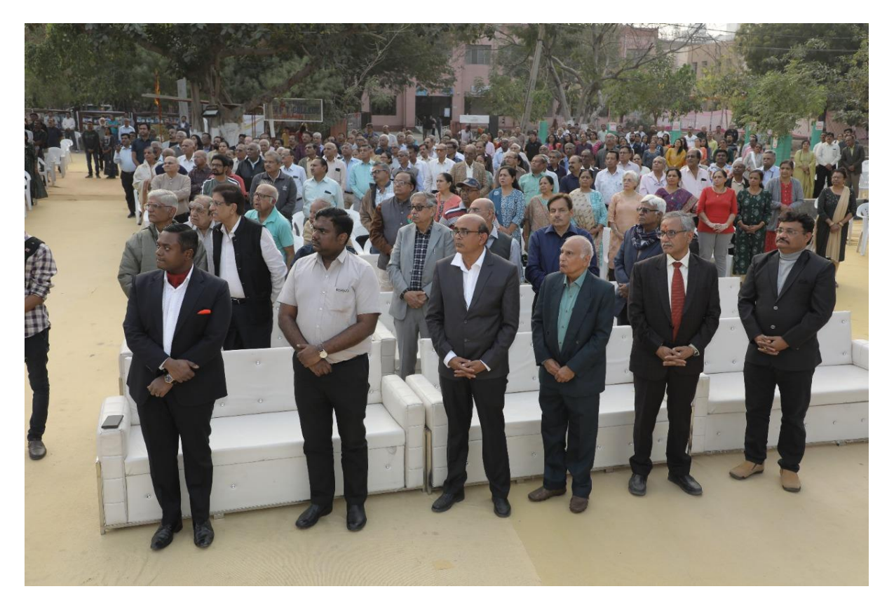
Tribute to departed souls of A.V.P.T.I. family because of Covid-19 followed by observance of silence