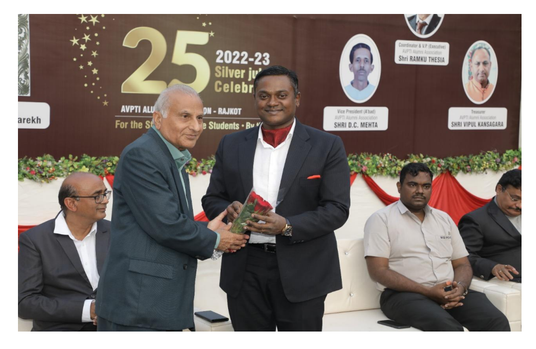
Welcoming of honourable guest of the function Shri Arun Mahesh Babu, IAS,Collector & DM Rajkot District

A collage of A.V.P.T.I.'s continuous efforts to develop the all-round development of the personality of its students. Stage functions, technical symposiums, great dance music drama performances, fashion shows, festive celebrations and so on.