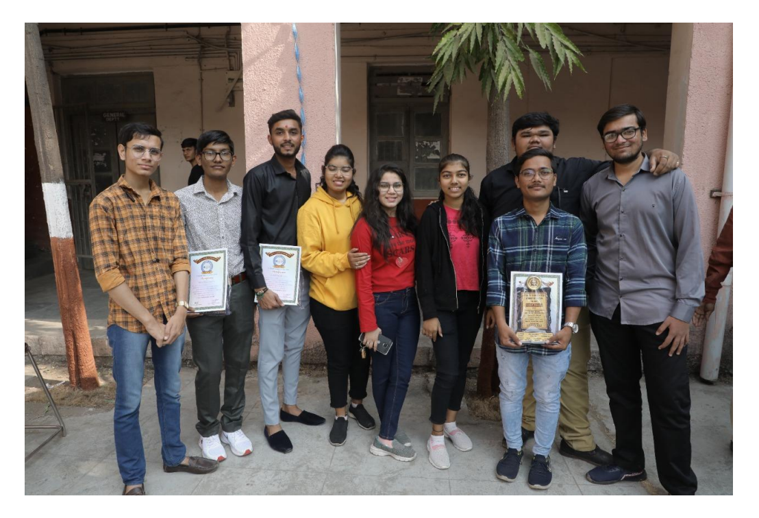
Group photograph of Toppers