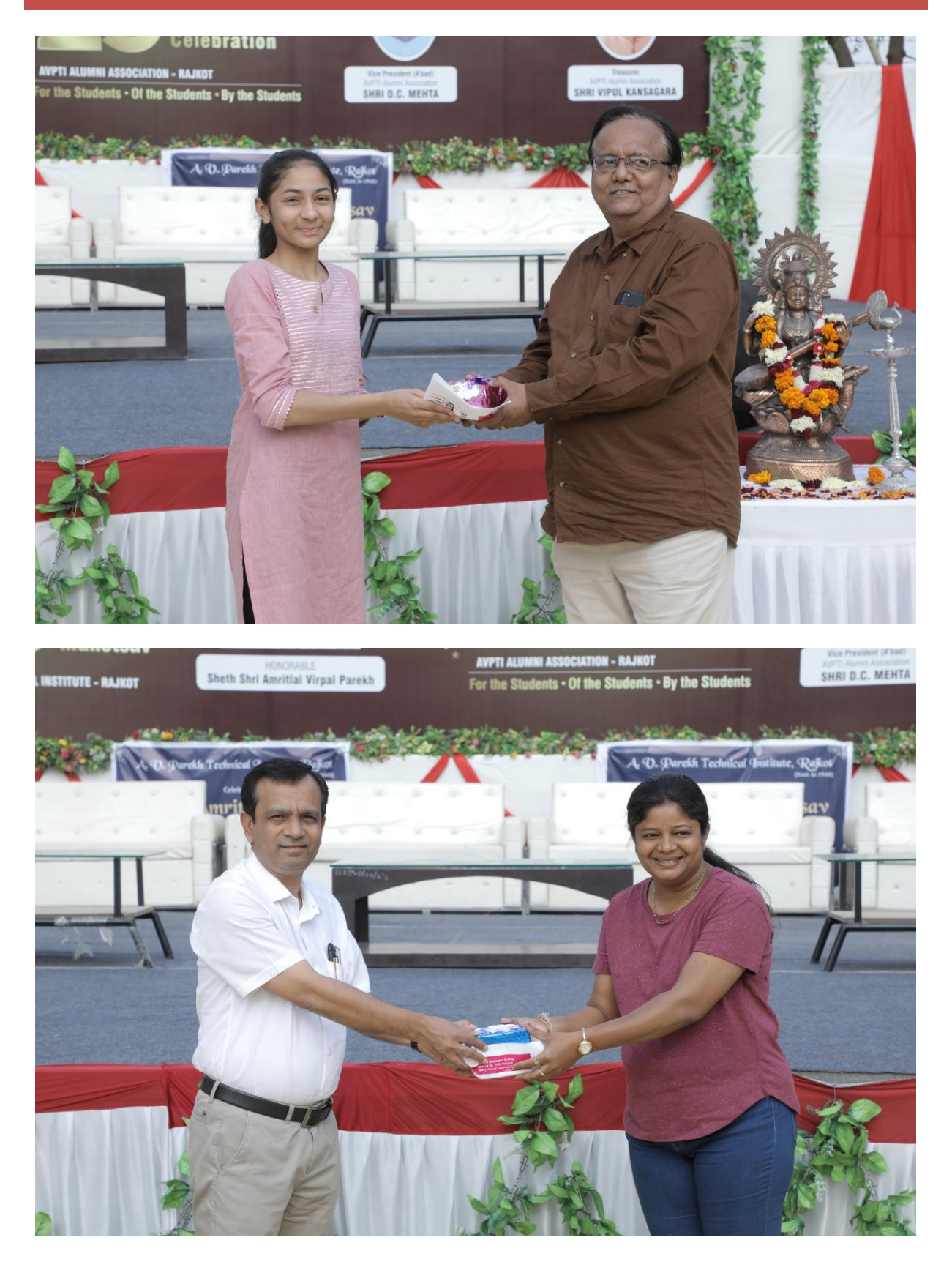
Winners in all games were also felicitated by gift