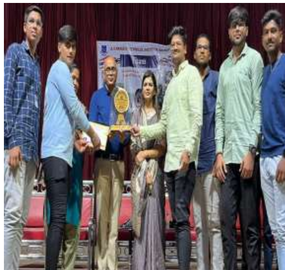
Winners of Tug of War – 4th Sem. EE