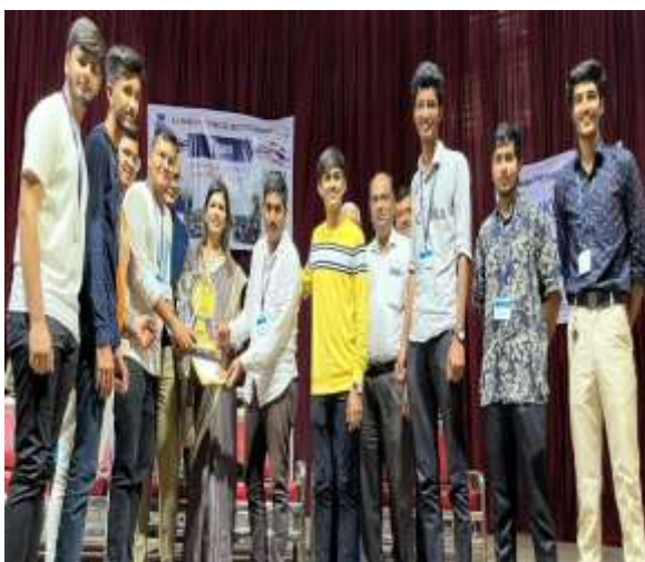
Runners-up of Volleyball – 6th Sem. CE