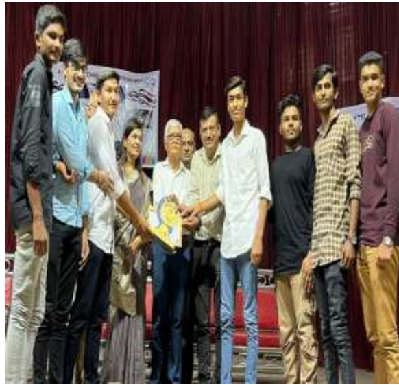
Winners of Kabaddi – 4th Sem. CE students