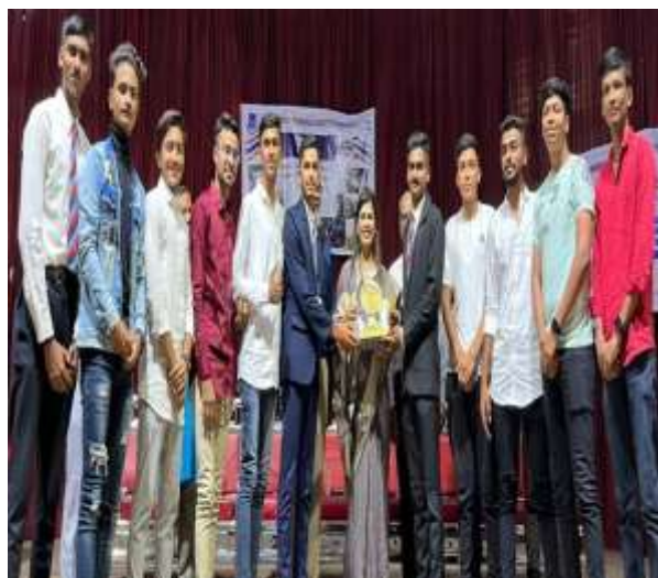
Winners of Cricket – 4 th Sem. Students of EE