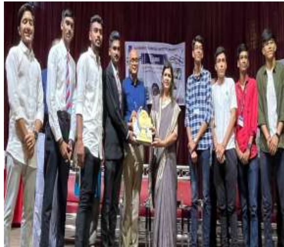
Winners of Volleyball – Students of EE