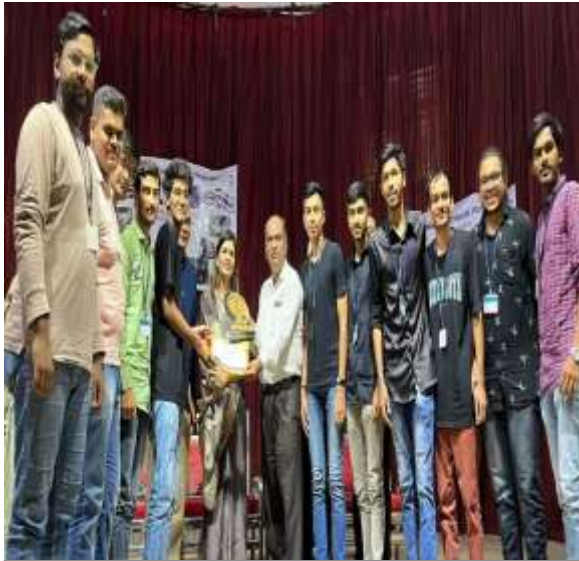
Runners-up of Kabaddi – 6th Sem. CE