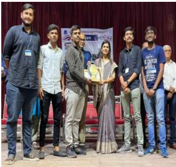
Runners-up Tug of War – 6th Sem. EE